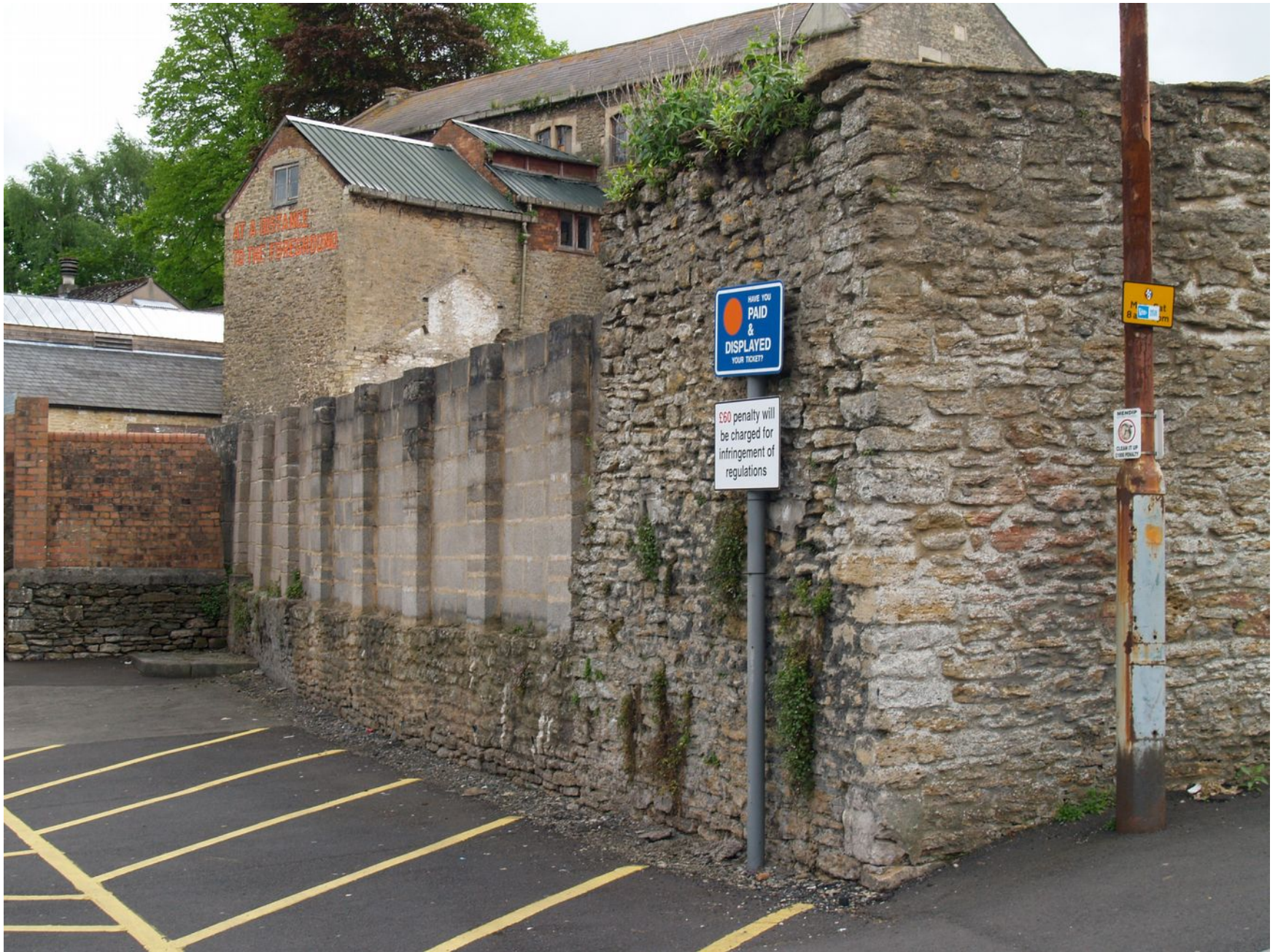
Lawrence Weiner, AT A DISTANCE TO THE FOREGROUND, 2008