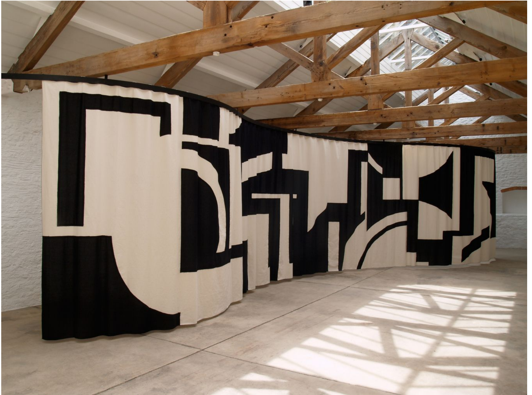
Eva Berendes, Somerset Curtain, 2008