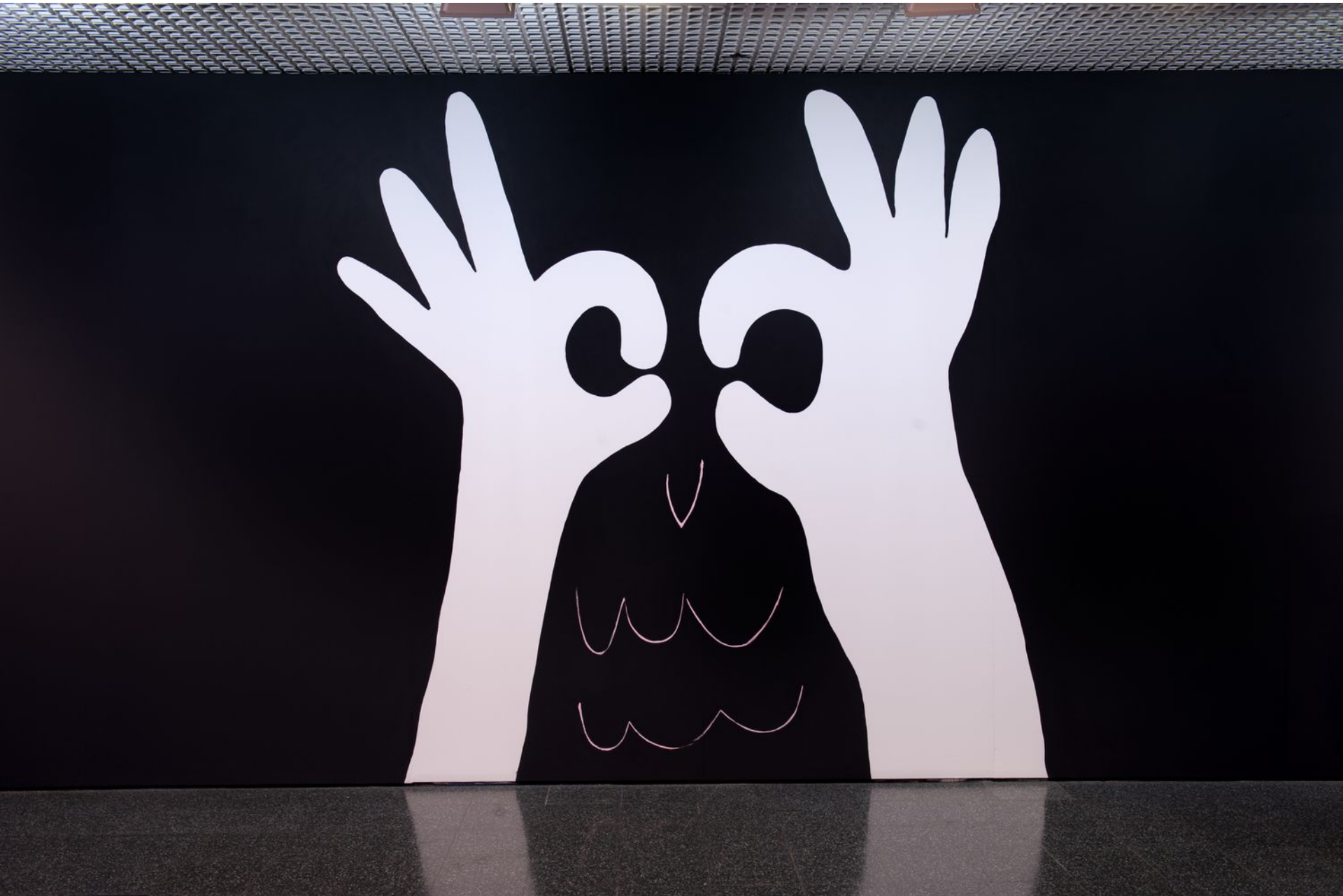
Cornelia Baltes, Turner, 2015