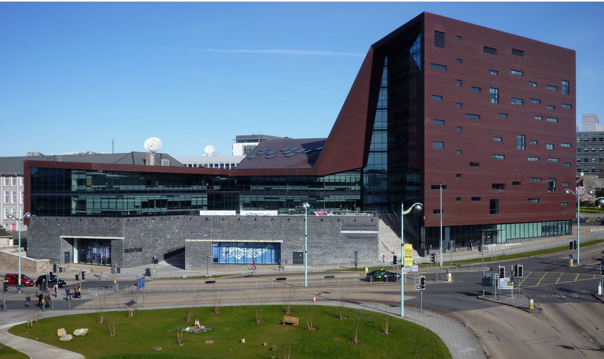
Plymouth University, Plymouth