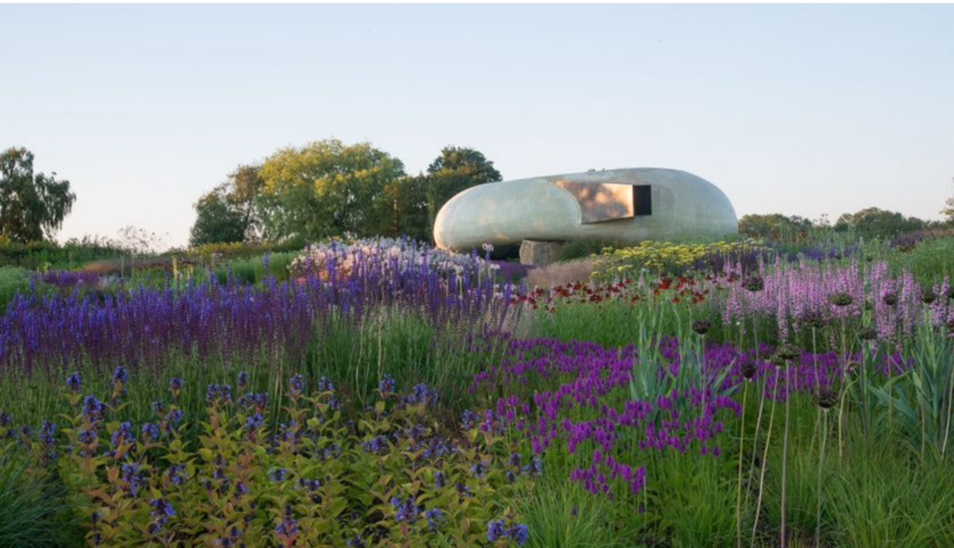
Hauser & Wirth Somerset