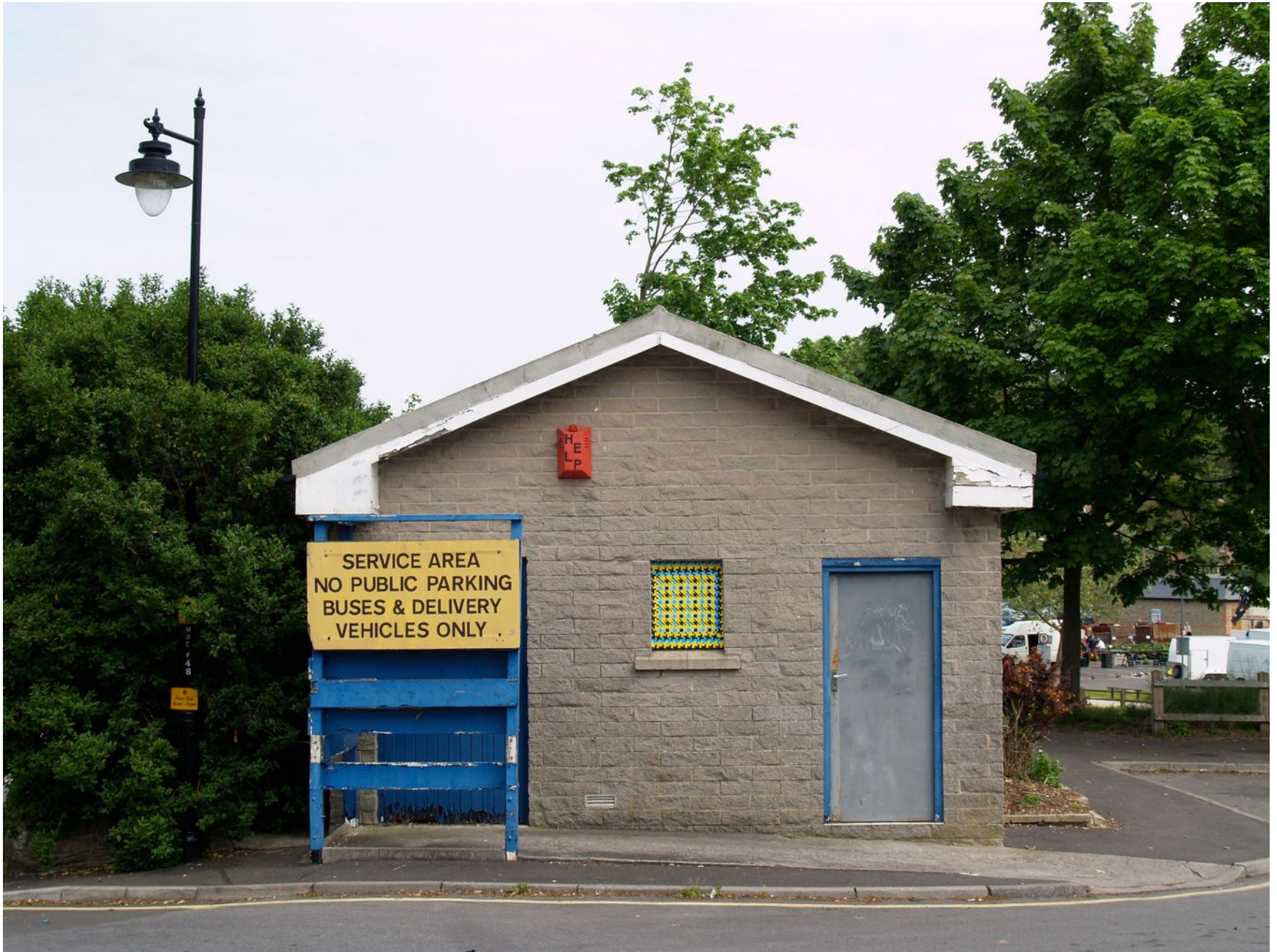
Jim Isermann, Untitled (Frome), 2008