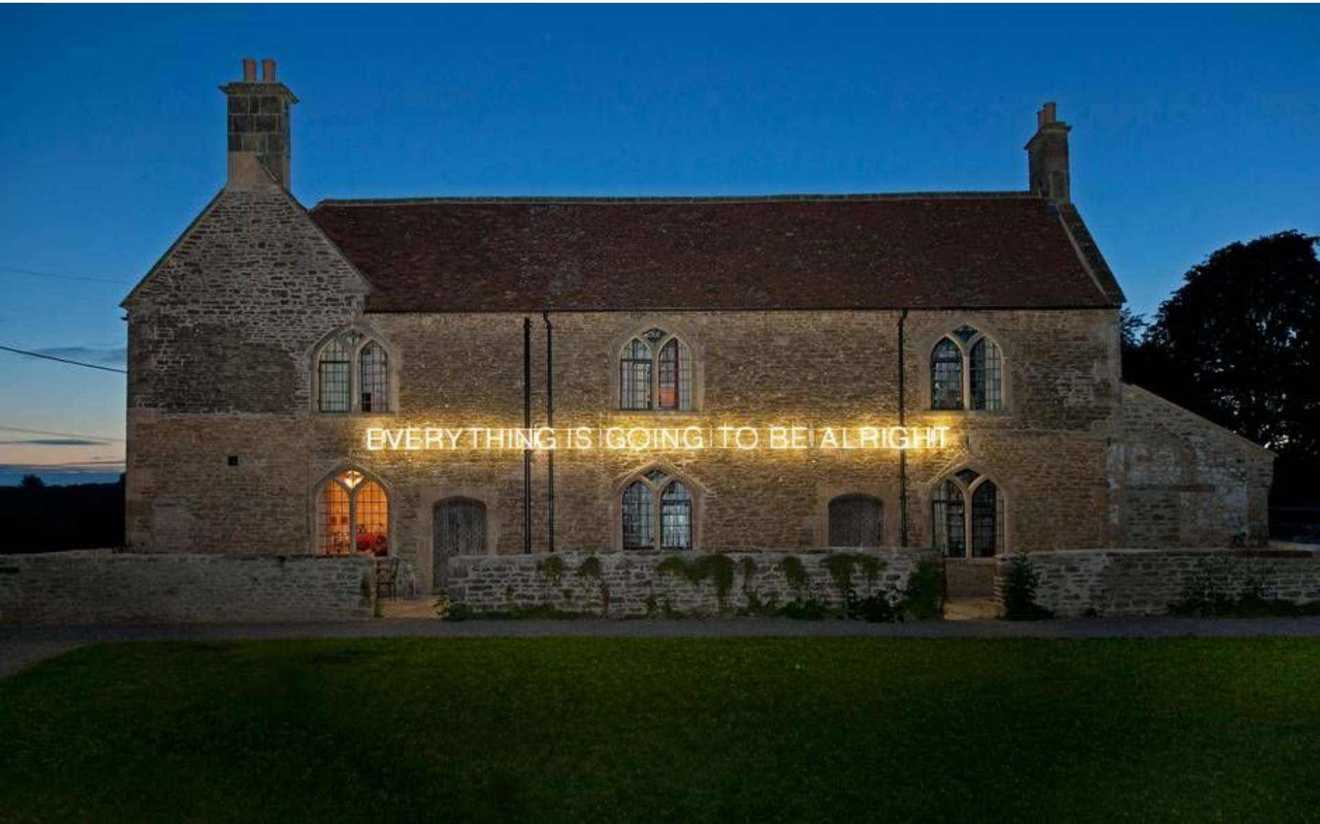
Hauser & Wirth Somerset