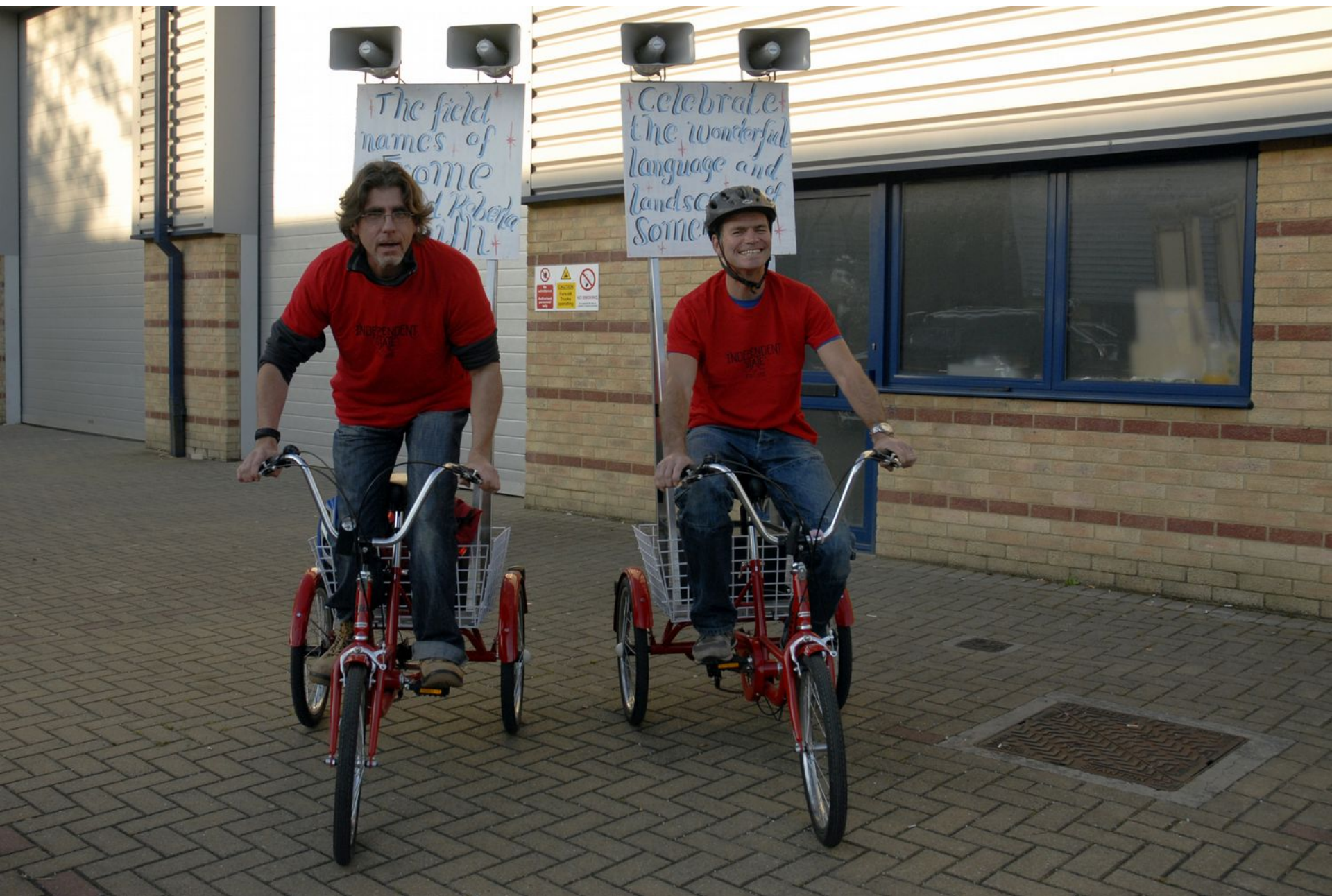
Bob and Roberta Smith. The Bob & Roberta Smith Field Recordings of Frome, 2009