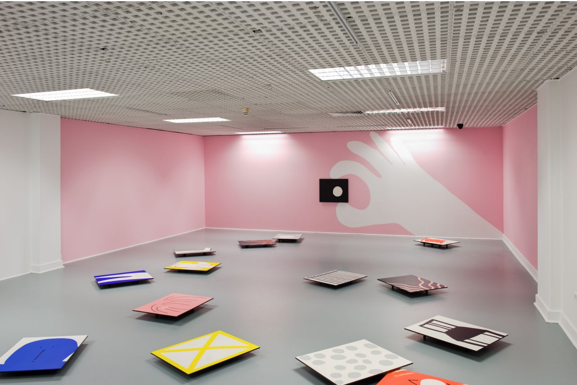
Cornelia Baltes, Turner, 2015