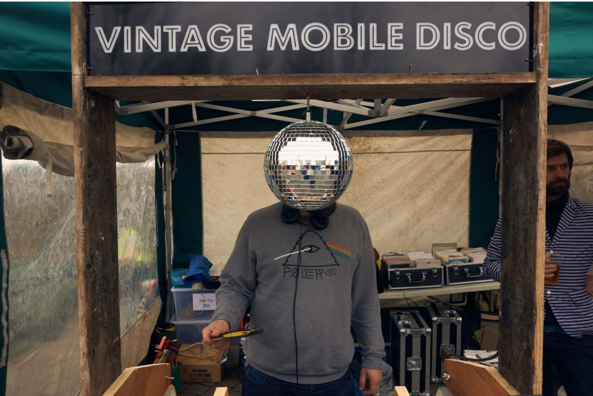
The Vintage Mobile Disco at The Frome Independent, 2015