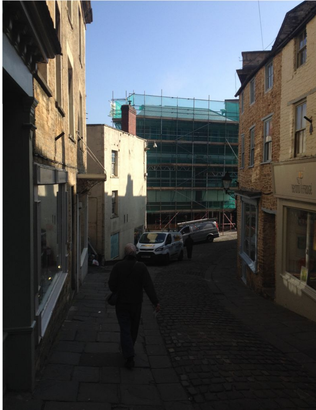
Former Poundstretcher Store, Stoney Street, Frome