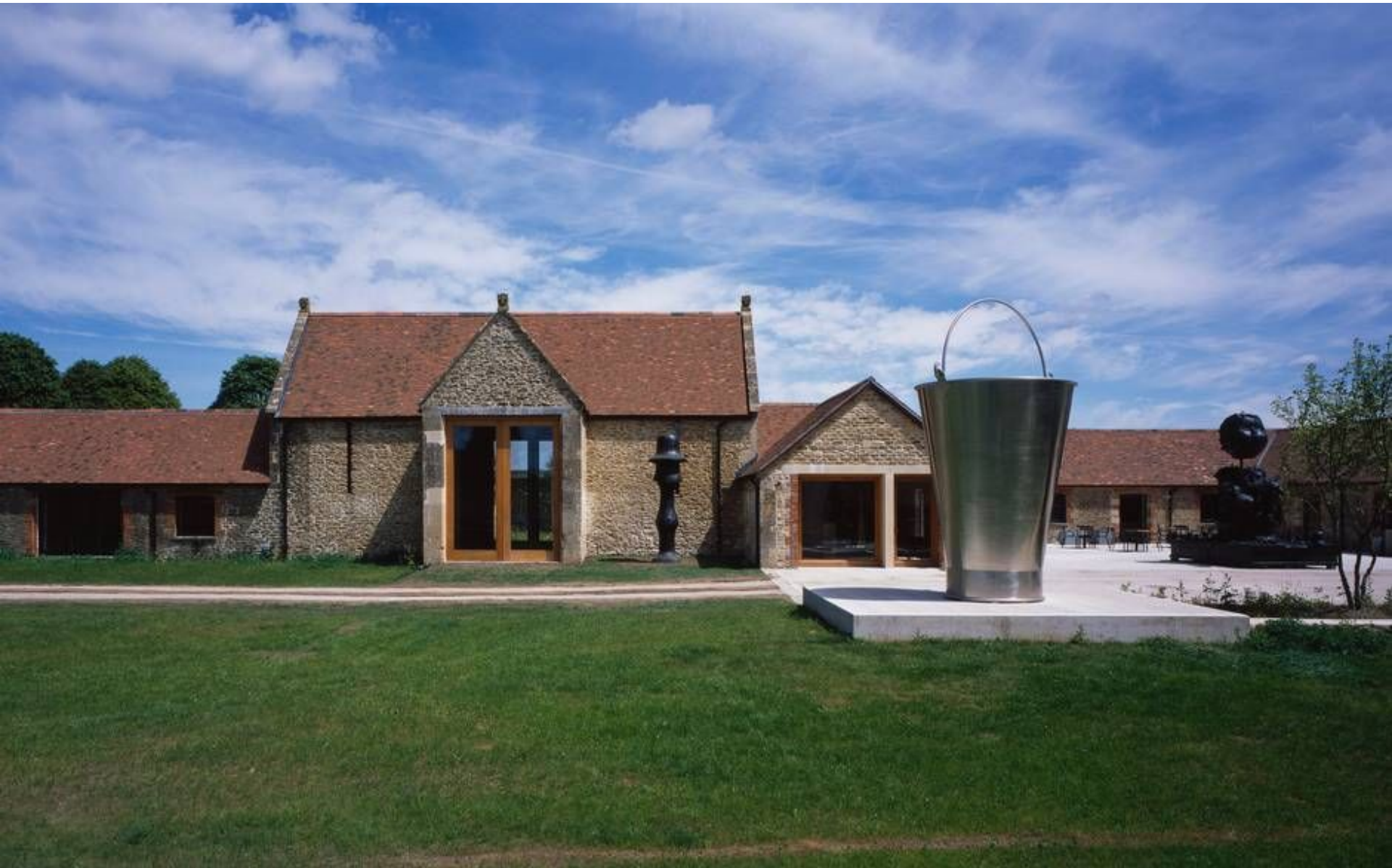
Hauser & Wirth Somerset