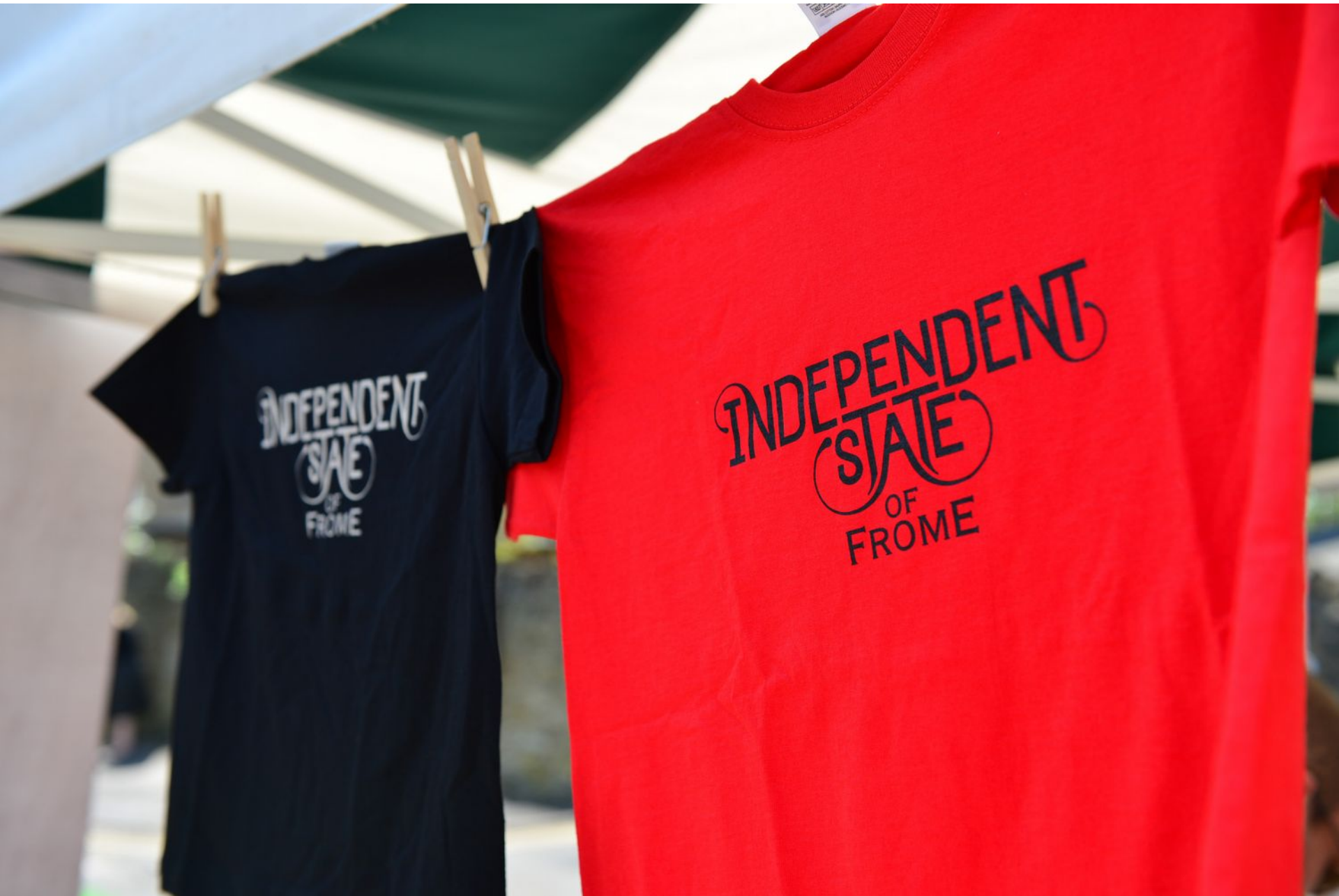
Foreground Independent State of Frome t-shirts at The Frome Independent, 2014