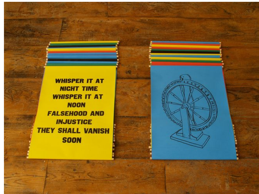
Ruth Ewan, Unrecorded future, tell us what broods there, 2008