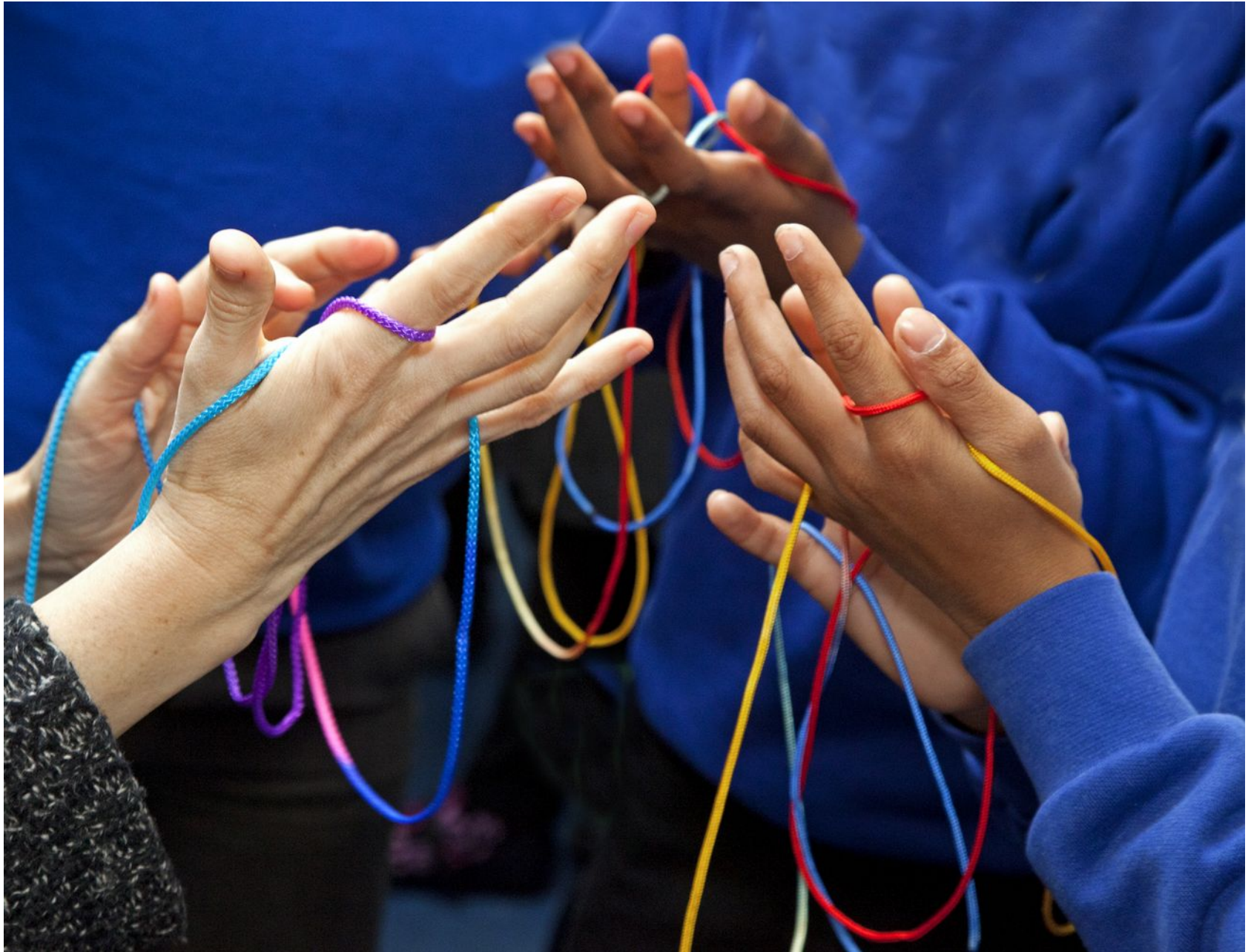
Olivia Plender, Easton String Games, 2015