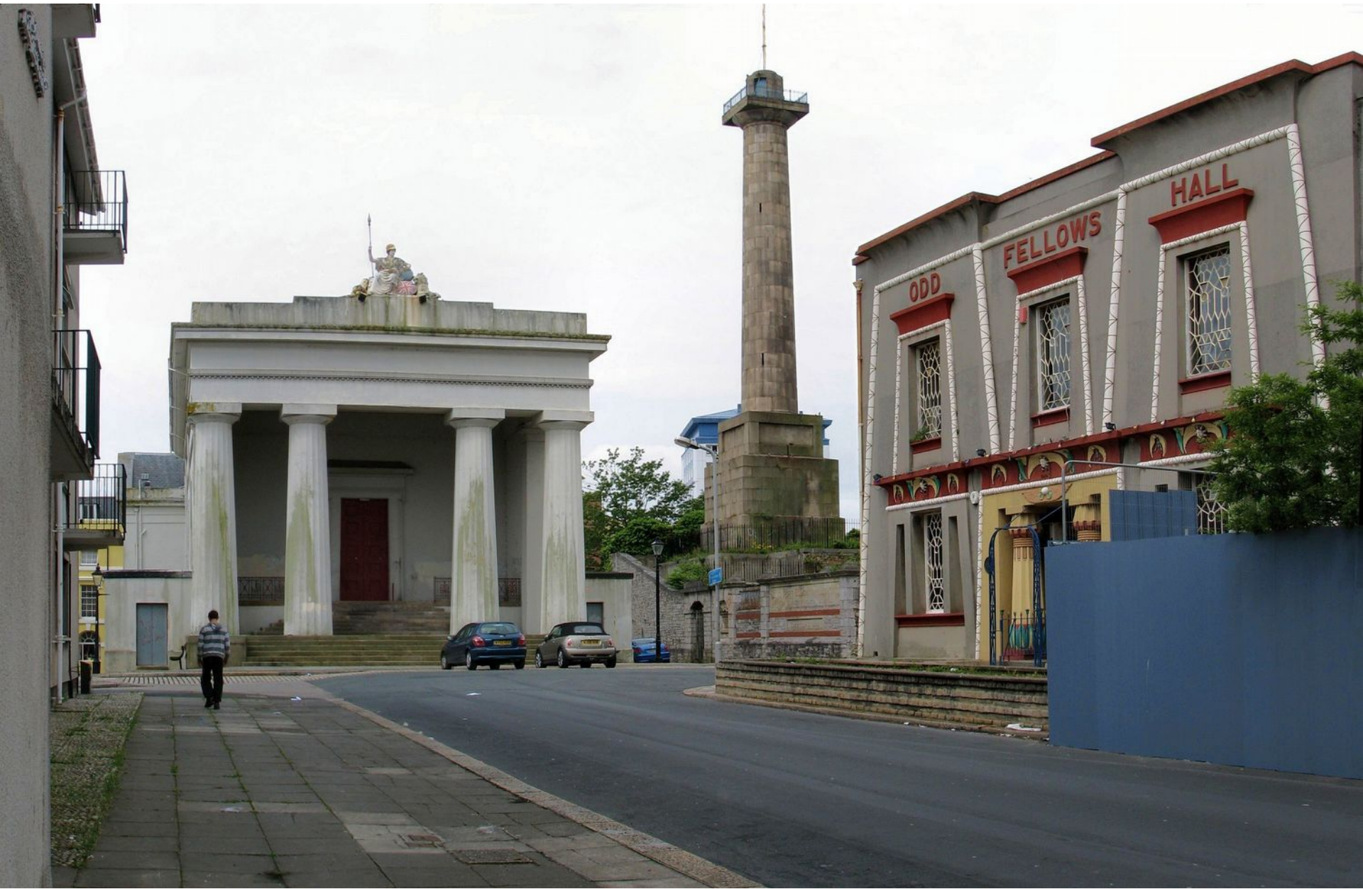
Devonport Town Hall, Odd Fellows Hall and Column, Plymouth