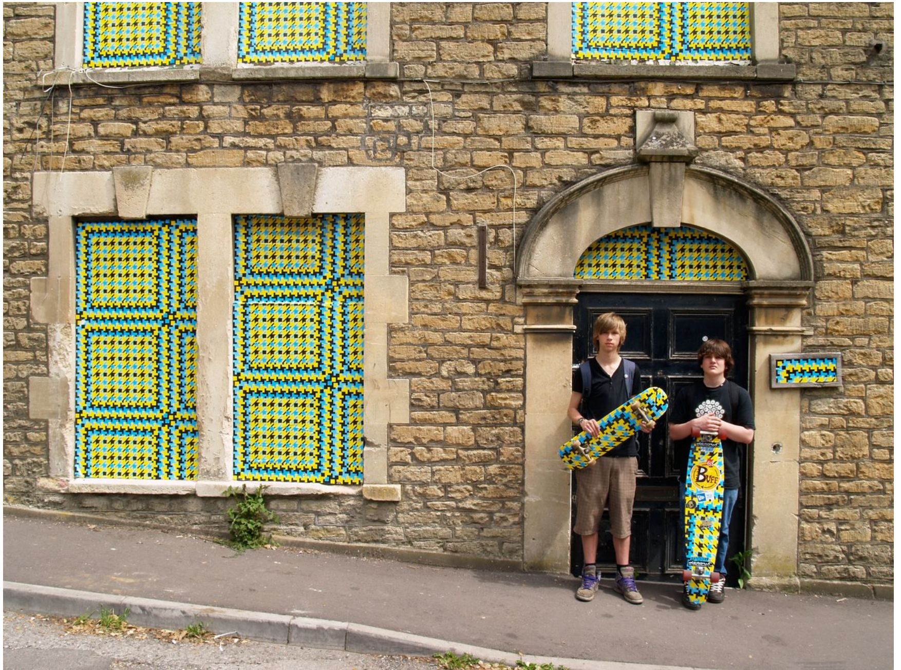
Jim Isermann, Untitled (Frome), 2008