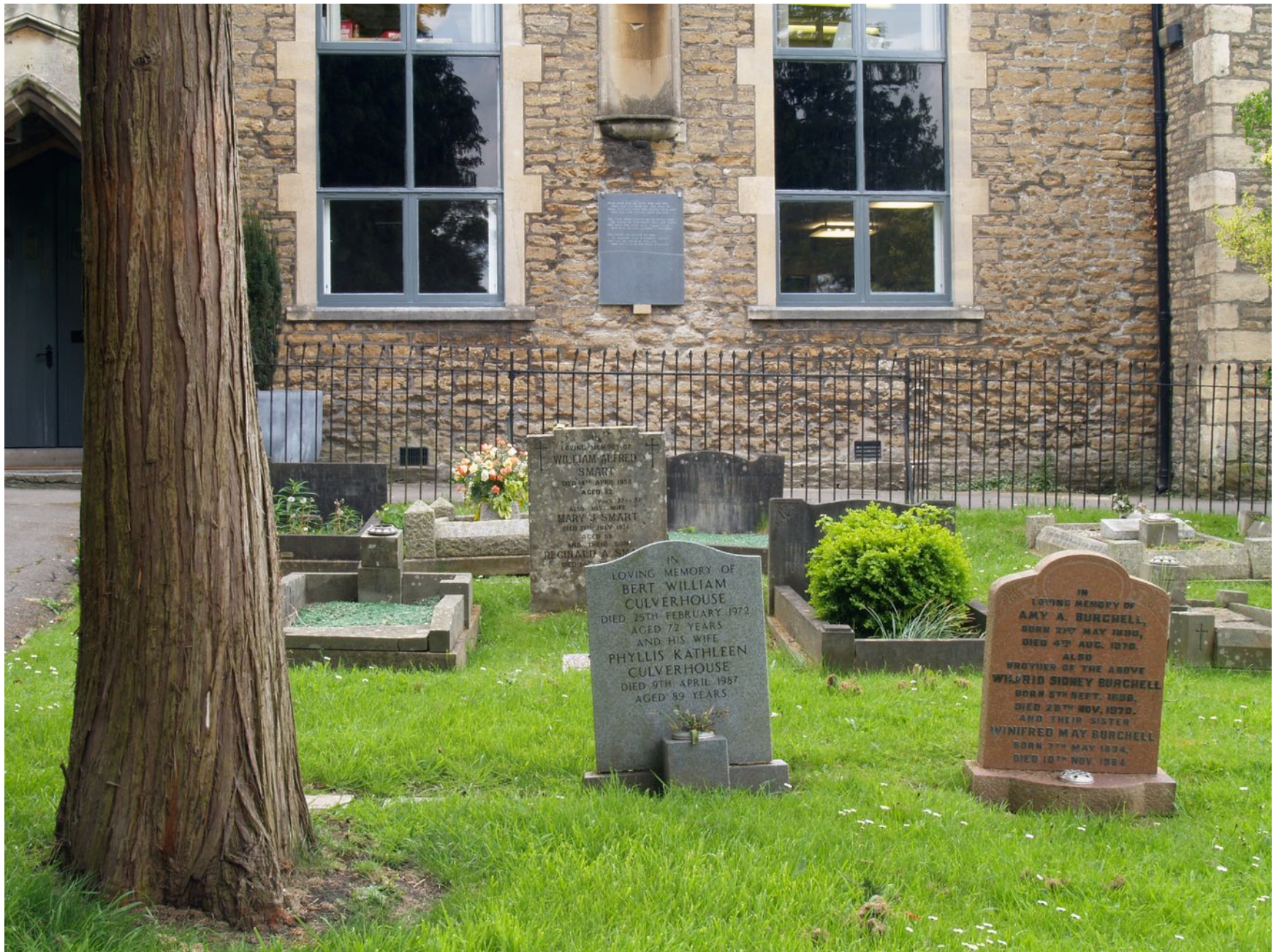
Cornelia Parker, Loadstone (Elegy for an English Country Graveyard), 2008