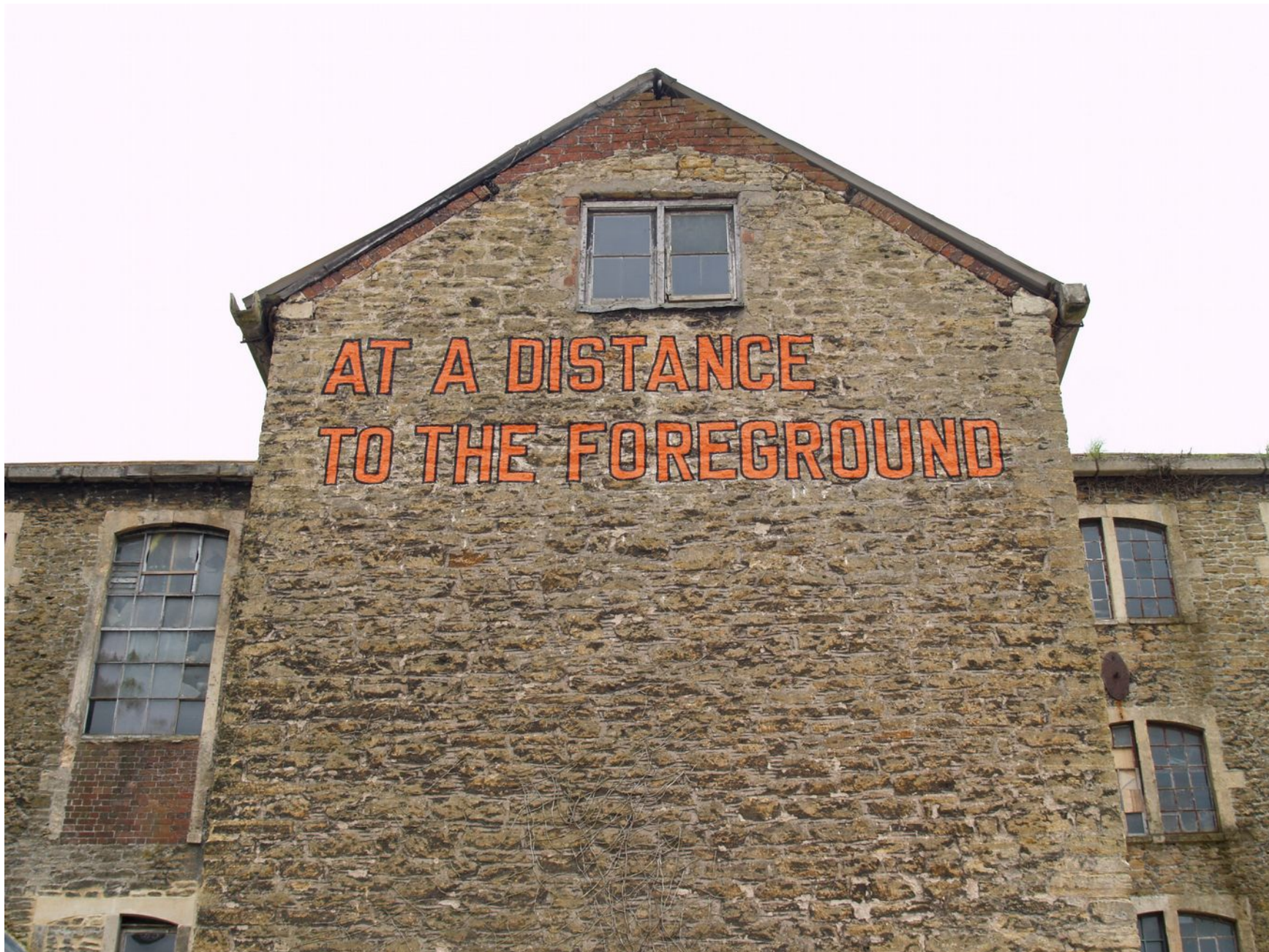
Lawrence Weiner, AT A DISTANCE TO THE FOREGROUND, 2008