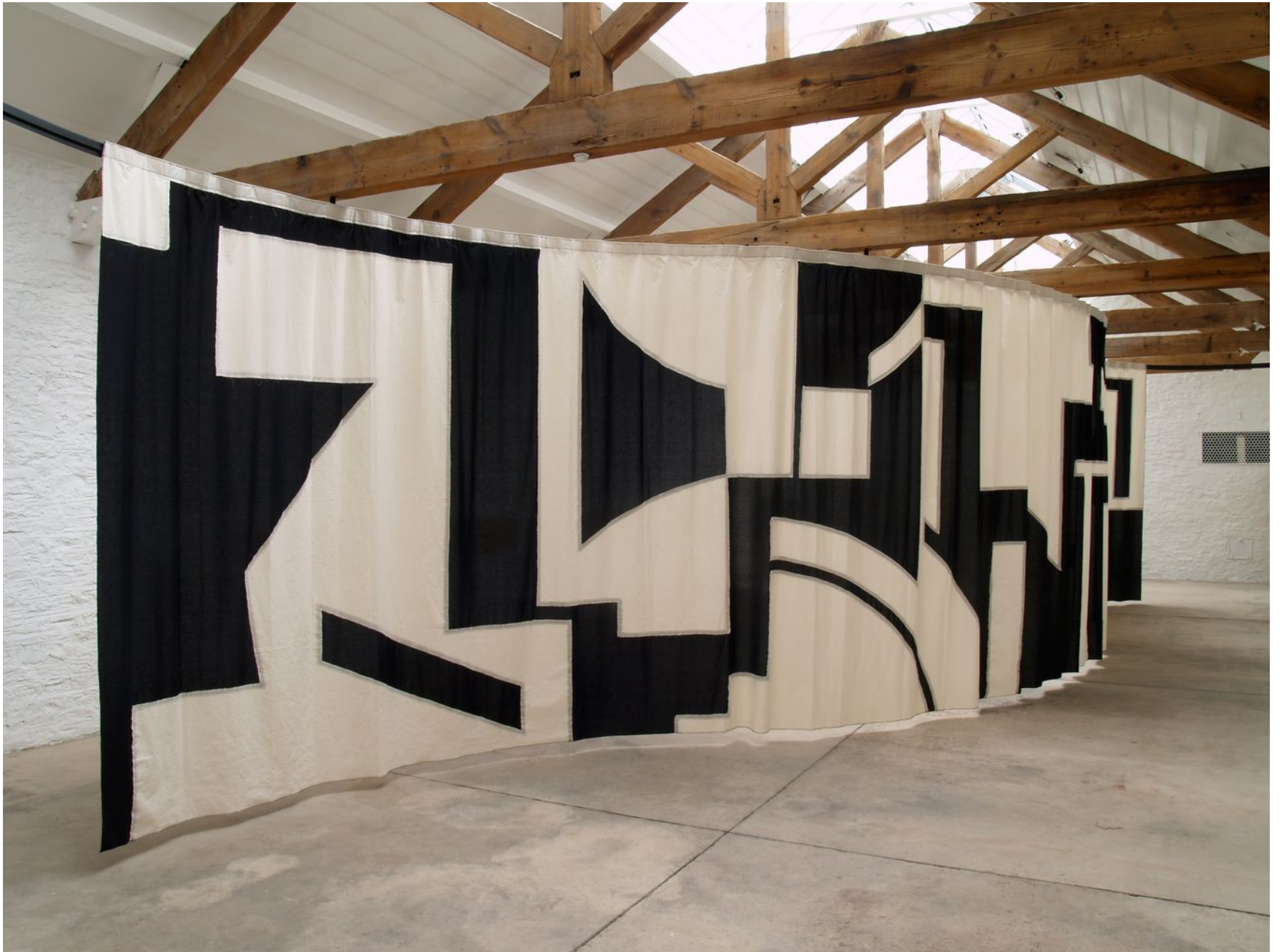
Eva Berendes, Somerset Curtain, 2008