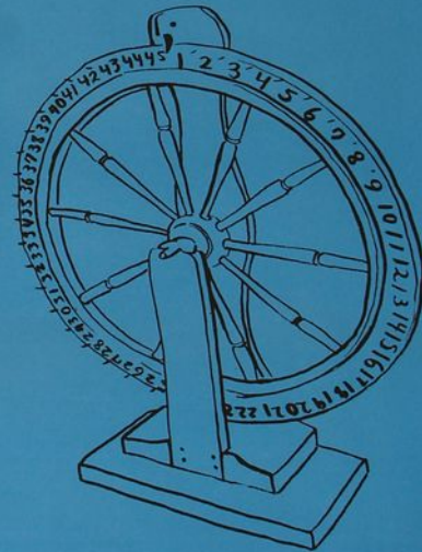
Ruth Ewan, Unrecorded future, tell us what broods there, 2008

WHISPER IT AT NIGHT TIME WHISPER IT AT NOON FALSEHOOD AND INJUSTICE THEY SHALL VANISH SOON