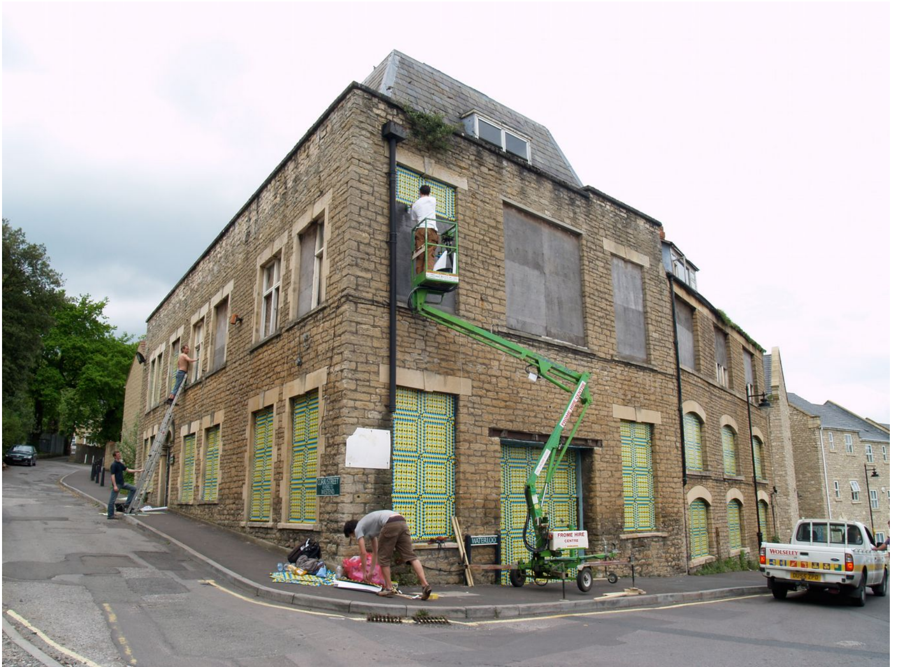
Jim Isermann, Untitled (Frome), 2008