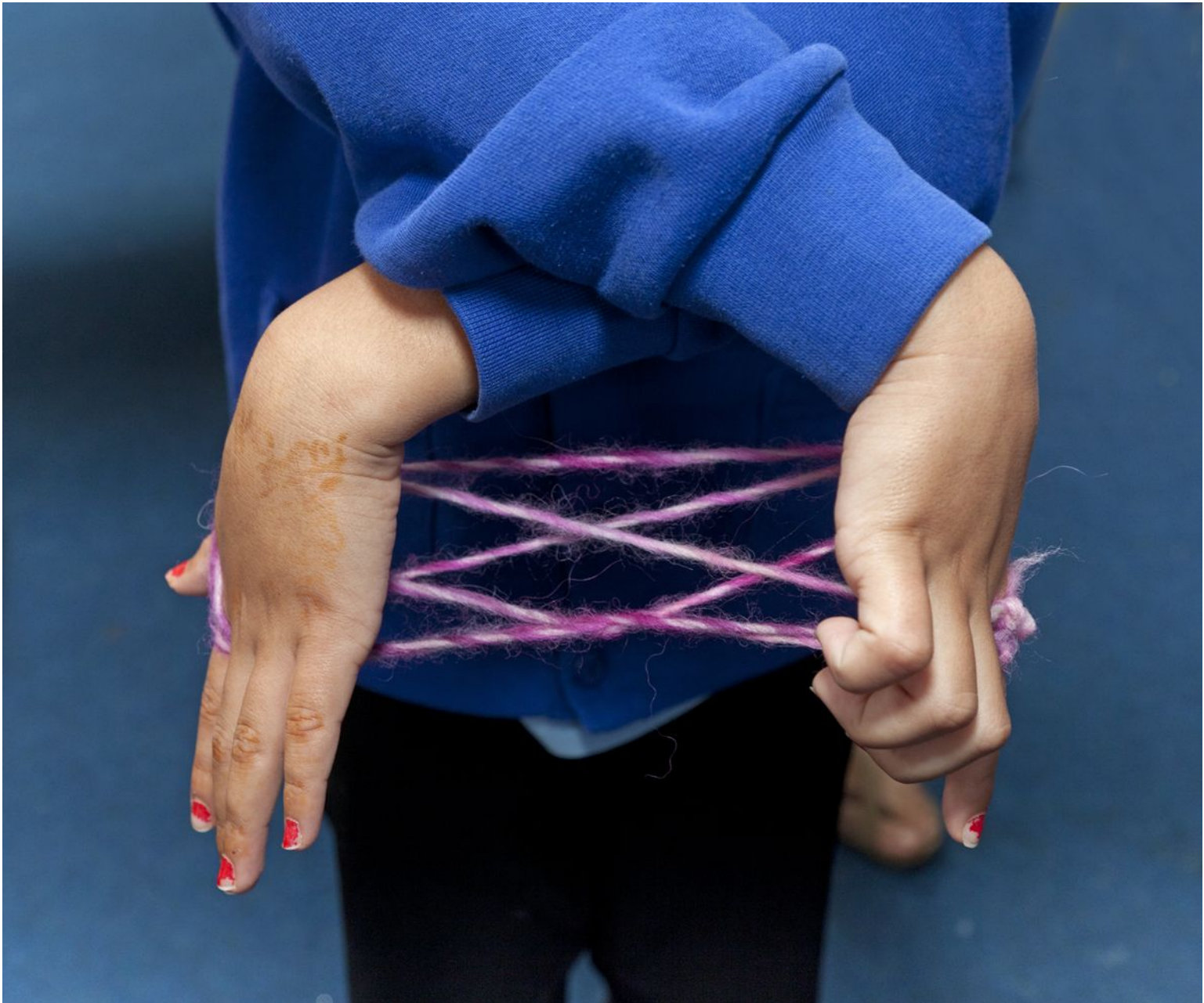
Olivia Plender, Easton String Games, 2015