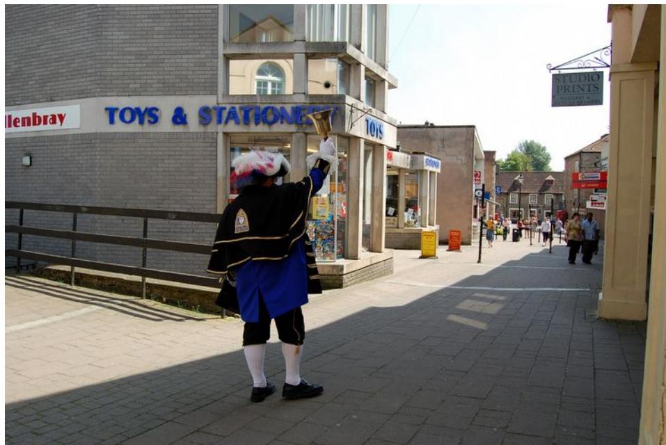
Ruth Ewan, Unrecorded future, tell us what broods there, 2008