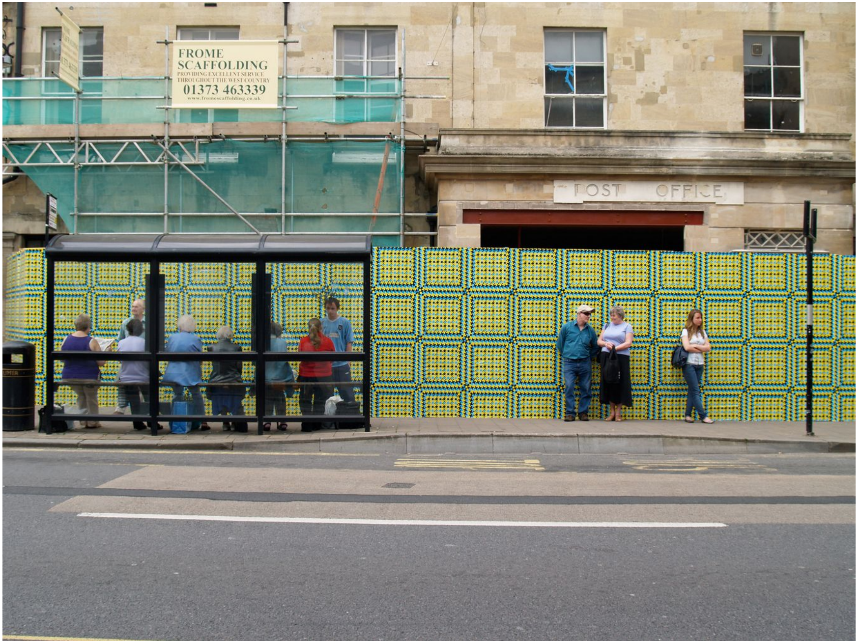
Jim Isermann, Untitled (Frome), 2008