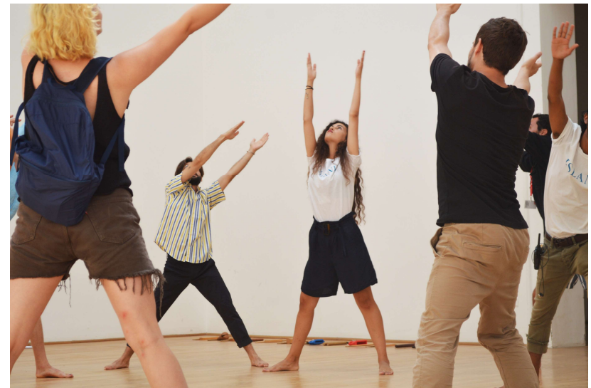
Royal Academy of Arts workshop

“I had the opportunity to expand my network and gain contacts for future collaborations in both academic and professional fields”