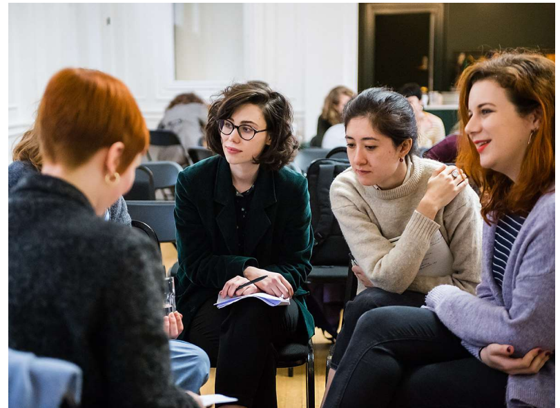
Induction School 2018