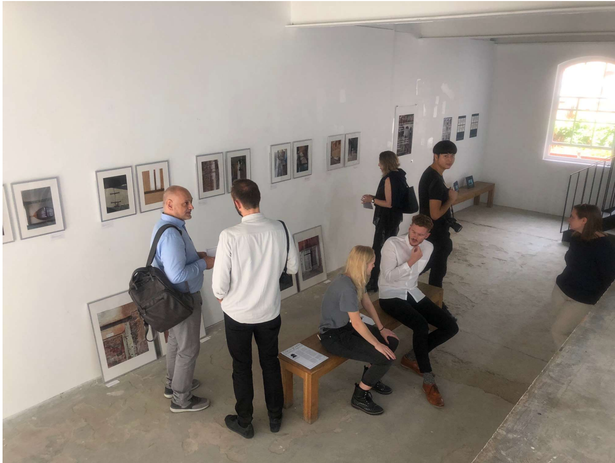
Exhibition by Group 1 Fellows, 2018