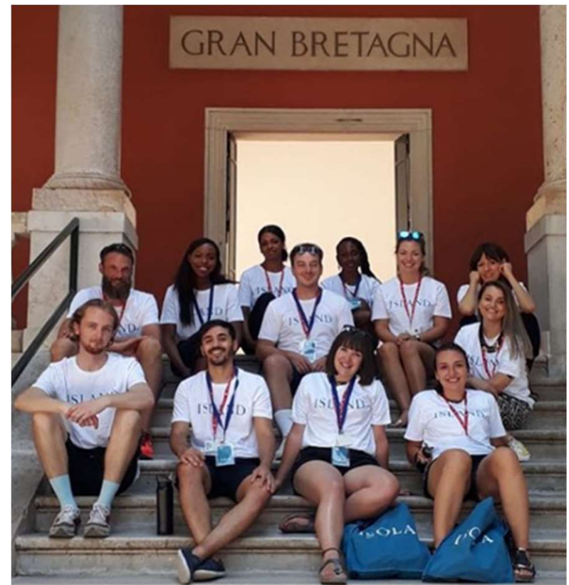
Group 4 Fellows, 2018